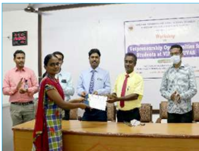
VC & RI, Namakkal