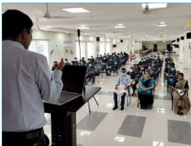
VC & RI, Orathanadu