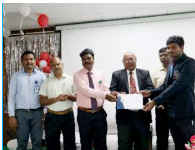
VC & RI, Tirunelveli