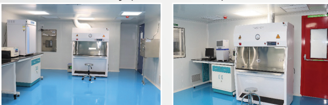
Clean room facility equipped with Class II Bio-safety cabinet