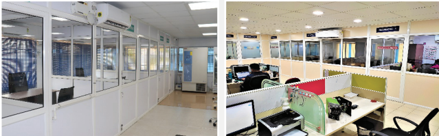
a) Large Cubicle @ Rs. 5000/- per Month

Veterinary Incubation Foundation (VIF) @TANUVAS has dedicated office space and Co-working space for the incubatees