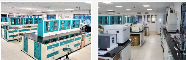
Laboratory for R&D in Biochemical and Molecular Biology approach